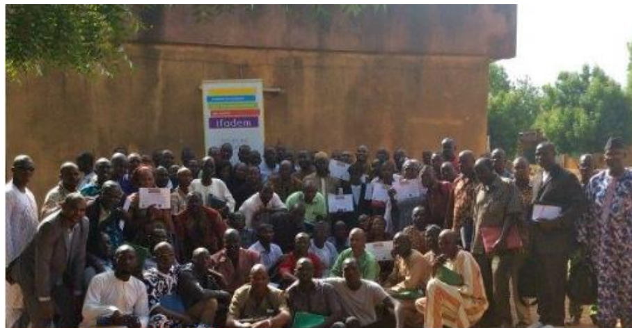
Formation des professeurs des IFM au dispositif IFADEM (Mali)

Countries involved Burkina Faso Comoros Mali Chad